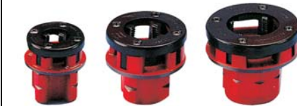
Supertronic 1250 Part # 8662130