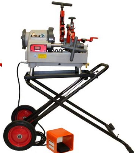
Shown with Optional Stand #56025