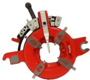
Automatic Die Head for Ridgid® Style Dies 1/2"-2"