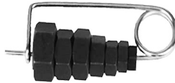
NPT Hex Rethreading Set (5 Piece) 3/8"- 1-1/4" Part# RDS02