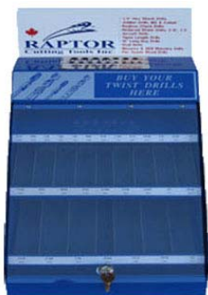
29 Piece Drill Display #13126