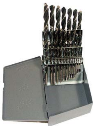
29 Piece Drill Set in Huot Case #R9802