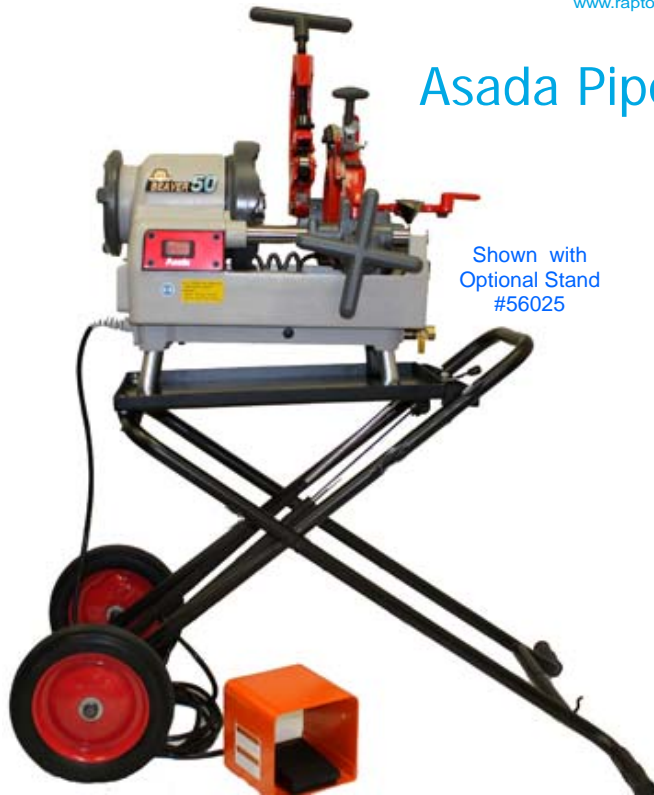
Shown with Optional Stand #56025